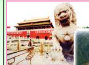
Tian'an men Square