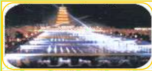
Big Wild Goose Pagoda