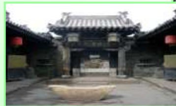
Pingyao Ancient City