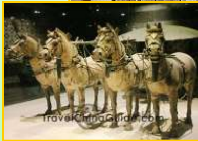
Qin Terracotta Army Museum