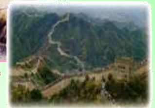
Badaling Great Wall